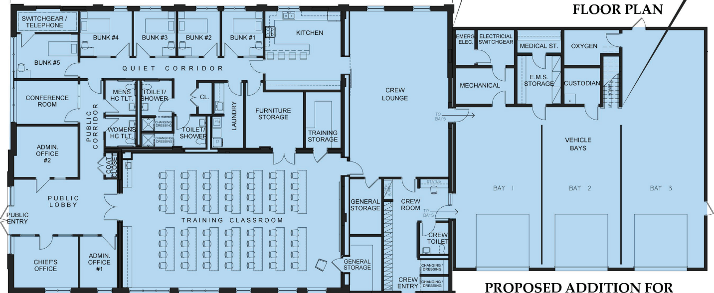
PROPOSED FLOOR PLAN