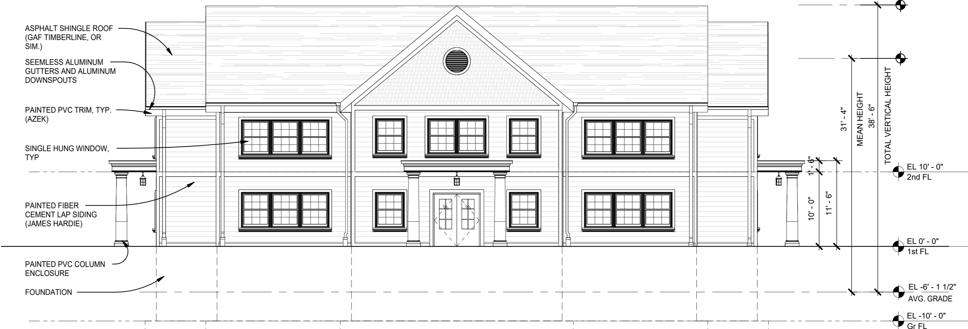
S SOUTH ELEVATION 1/8" = 1'-0"