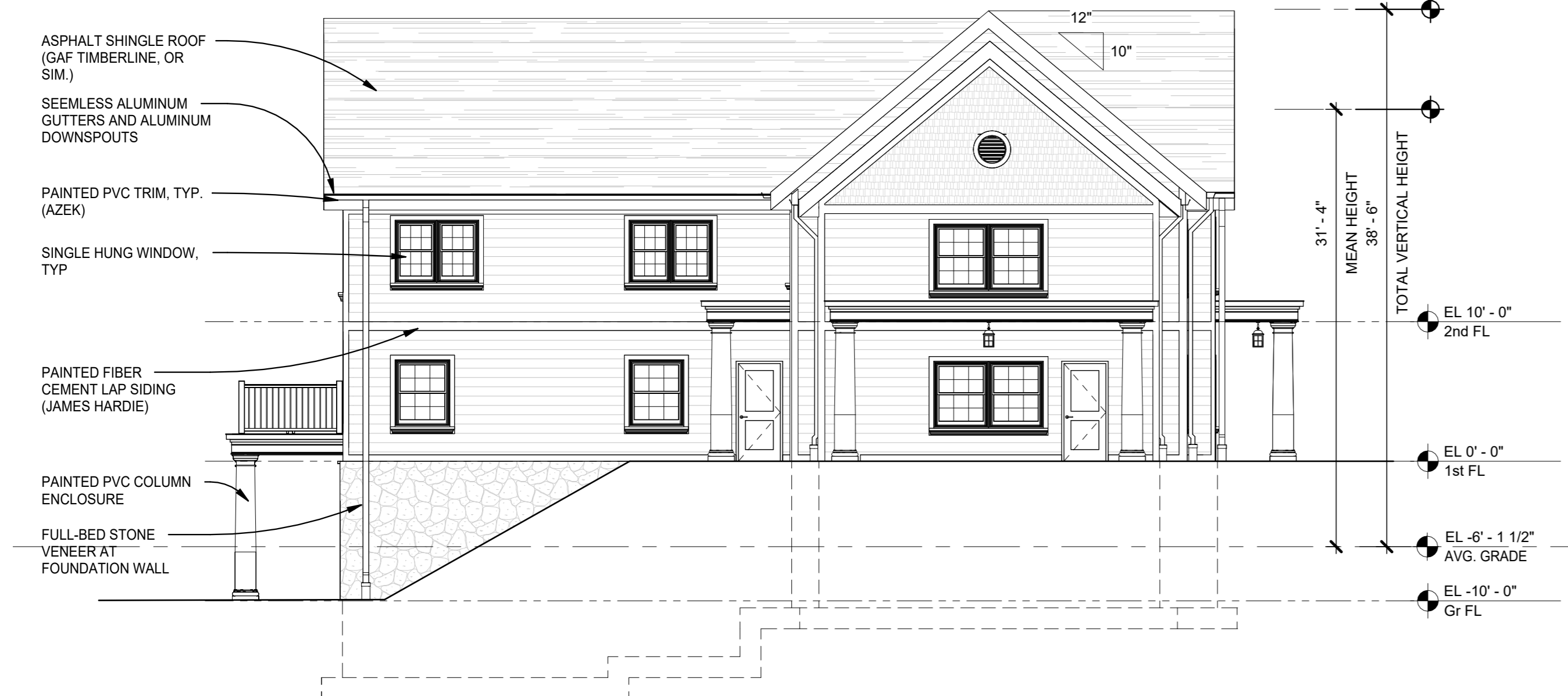
W WEST ELEVATION 1/8" = 1'-0"