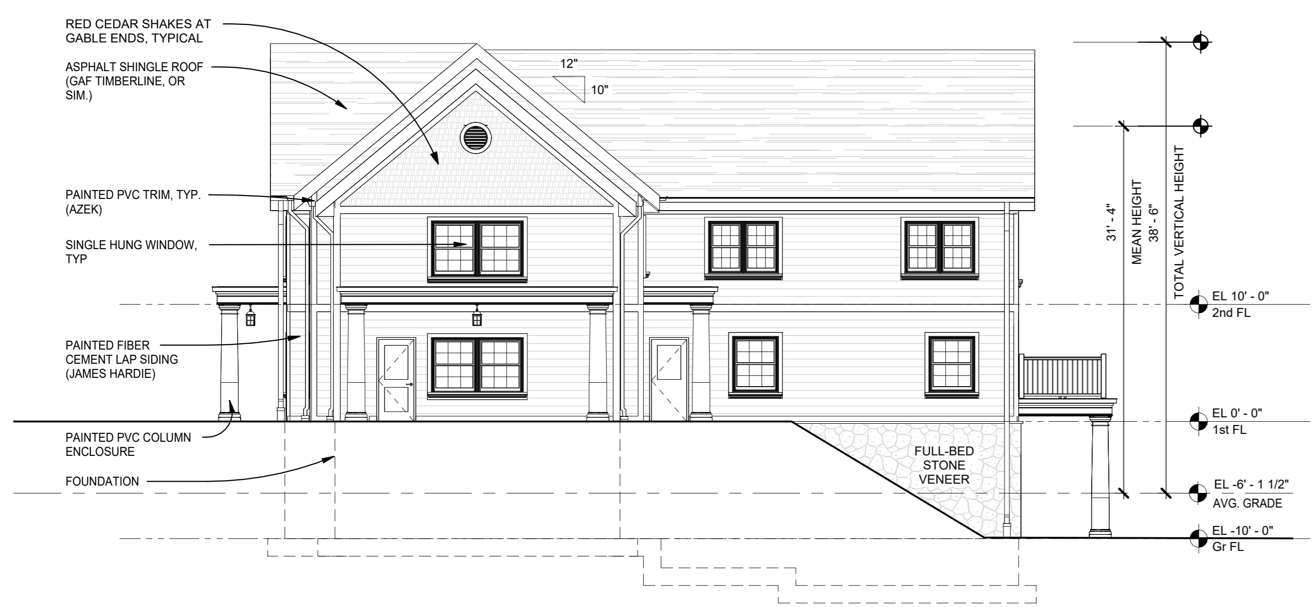
E EAST ELEVATION 1/8" = 1'-0"