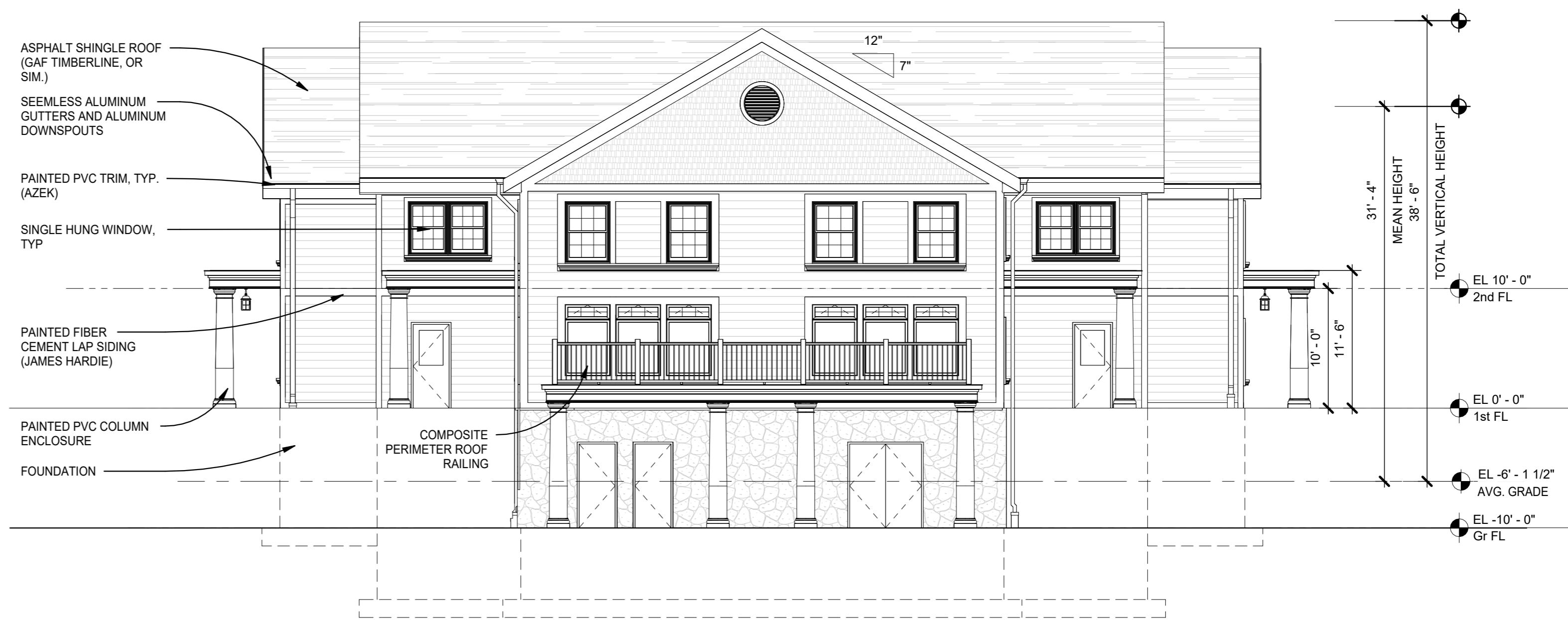
N NORTH ELEVATION 1/8" = 1'-0"

NOTE: ALL IDEAS, DESIGNS, ARRANGEMENTS AND PLANS INDICATED OR REPRESENTED BY THIS DRAWING ARE OWNED BY AND ARE THE PROPERTY OF KG+D ARCHITECTS, PC AND WERE CREATED FOR USE ON THIS PROJECT. NONE OF SUCH IDEAS, DESIGNS, ARRANGEMENTS OR PLANS SHALL BE USED BY OR DISCLOSED TO ANY PURPOSE WHATSOEVER WITHOUT THE WRITTEN PERMISSION OF KG+D.