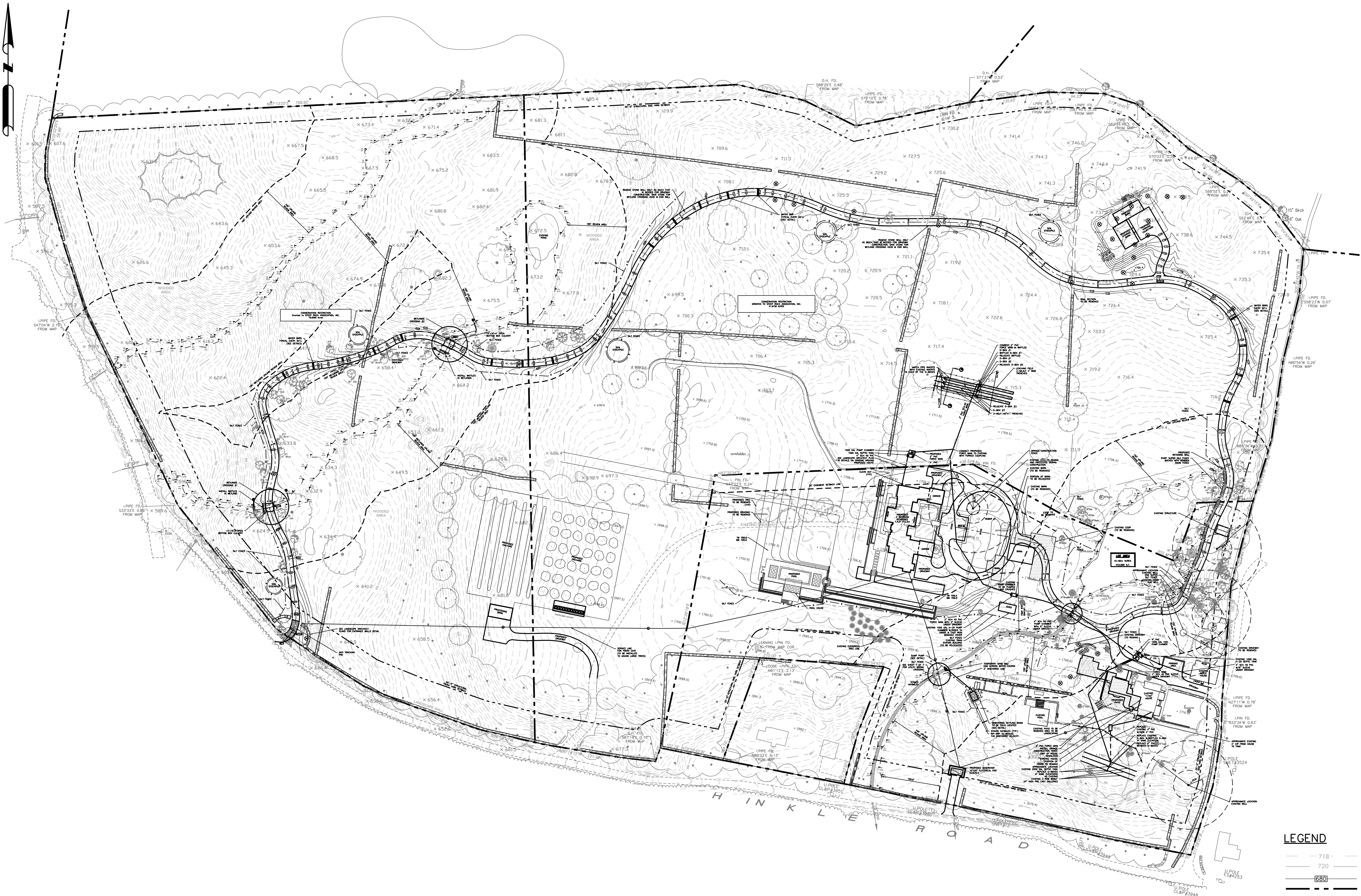
OVERALL SITE PLAN SCALE: 1"=80'

NOTE: 1) EXISTING CONDITIONS AND TOPOGRAPHIC INFORMATION TAKEN FROM PLANS PREPARED BY ARTHUR HOWLAND, NEW MILFORD, CT, DATED 11/2/20