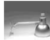
Hubbell Skycap Yard Light Package