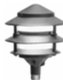
RAB Landscape Lighting