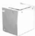
RAB Shade Small