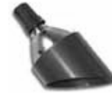
Parashield Glare Visor