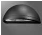
Impact Quarter Sphere