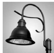
Visionaire Monterey Pole Lighting

What we need are lighting solutions that support safe, energy-efficient, appropriately-lighted outdoor environments. In the process, it's estimated that nationwide we can save up to $4.5 billion dollars annually in non-wasted energy for unnecessary and excessive lighting! The equation is simple: Energy Efficiency = Money Saved.