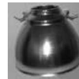
GE Skygard Shield