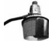
Lite-Blocker External Shield